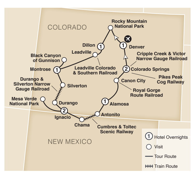
DAY 1 Arrive in Denver: Welcome to Denver, the "Mile High City." Meet your fellow travelers at 5:00 p.m. for a getacquainted dinner hosted by your Tour Manager. Meal: D

DAY 2 Rocky Mountain National Park: Departing Denver, venture into Rocky Mountain National Park, a living showcase of the grandeur of the Rocky Mountains. With elevations ranging from 8,000 feet on the wet, grassy valleys to 14,259 feet at the weather-ravaged top of Longs Peak, the park is filled with breathtaking scenery and experiences. Following the Trail Ridge Road a stop at the Alpine Visitor Center offers an opportunity to learn more about this fascinating place. Meal: B